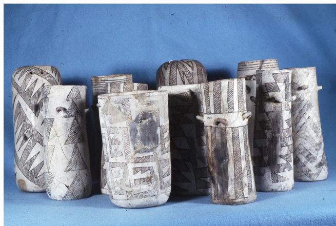
Fig. 1. Twelve cylinder jars from Pueblo Bonito housed in the Smithsonian Institution Department of Anthropology. Vessel in left center is 21.5 cm in height (Marianne Tyndall, photographer). [Reproduced with permission from Crown and Wills (8) (Copyright 2003, Society for American Archaeology).]

Among the many unusual objects from Pueblo Bonito are ceramic cylinder jars, vessels typically 2.4 times as tall as they are wide (Fig. 1). Most are painted with black designs on a white background, but red jars and white jars occur as well. Fewer than 200 cylinder jars are known from the American Southwest and 166 of these come from Pueblo Bonito. Excavation revealed 111 cylinder jars in a single large cache in one room at the site (5). While archaeologists generally agree that the vessels had a ritual