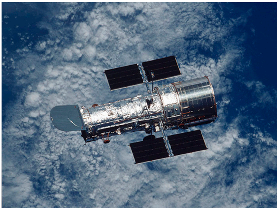
Fig. 2. The Hubble Telescope in orbit in 2009.