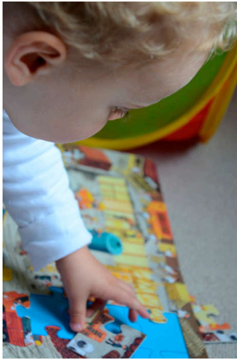
Fig. 2. Illustration of a template image. This template image was used to generate the two-tone image shown in Fig. 1A, Left . To experience the effect of knowledge on perception, the reader should look back at Fig. 1A after having viewed this template for some time. The perceptual experience of the two-tone image in Fig. 1A, Left , should have drastically changed from the initial viewing: rather than looking like meaningless patches, a coherent percept of the child and parts of the puzzle should now be experienced. The control image in Fig. 1A, Right , should still appear as meaningless patches.