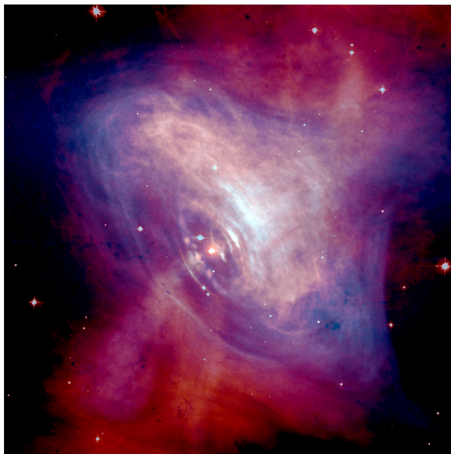
Fig. 1. A picture of the inner regions of the famous Crab Nebula captures emergent jets and the “Napoleon Hat” structure of surrounding plasma. The radio/optical/X-ray pulsar, a neutron star rotating at \sim 30 Hz, is buried in the center. The Crab was produced in a supernova explosion in A.D. 1054.

Author contributions: A.S.B. wrote the paper.