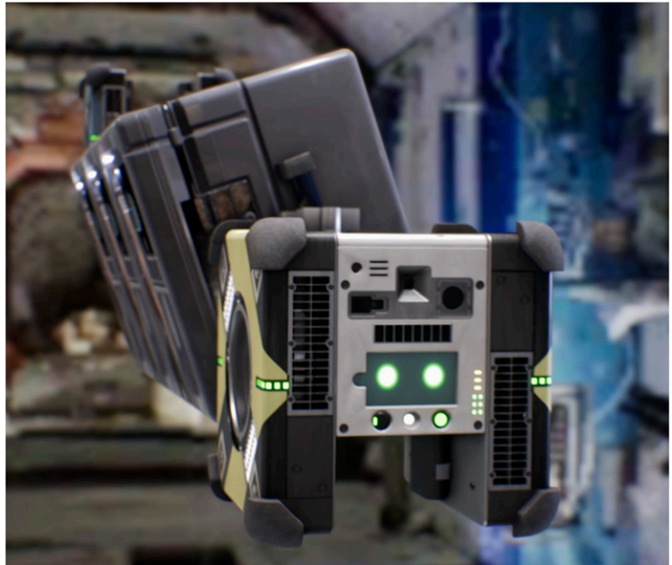
NASA expects that Astrobees, a free-flying robot, will begin working with humans aboard the International Space Station by the end of this year. This illustration shows what two Astrobees might look like as they cooperate to move cargo.

Last year, building on this predictive ability, the group tested a robotic system that assists in manufacturing (4). The robot moved along a straight line, picking up parts with a robotic arm and delivering the parts to humans building automotive engines. A Kinect motion sensor