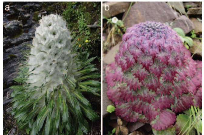
Fig. 1. Snow lotus used in traditional Tibetan and Chinese medicine. Shown are S. laniceps (a), the preferred species, and S. medusa (b), which is seldom collected or marketed.

Saussurea laniceps and Saussurea medusa (Asteraceae), known collectively as snow lotus (Fig. 1), are endemic to the eastern Himalayas. Both species have limited distributions on rocky habitats >4,000 m. Snow lotus is used in traditional Chinese and Tibetan medicine for the treatment of headaches and high blood pressure and to regulate menstrual cycles and treat menstrual problems (18). Although S. laniceps are primarily harvested as medicinal plants, they also have become popular souvenir items with tourists because they are strange-looking, rare, and grow in exotic locations (19). S. medusa are smaller and less frequently collected for medicine, sale, or souvenir. Larger individuals of S. laniceps are preferentially collected, because these are thought to be more potent and efficacious. Further, larger plants are easier to find. Regrettably, the whole plant of this monocarpic, long-lived species is harvested during the final flowering period, just