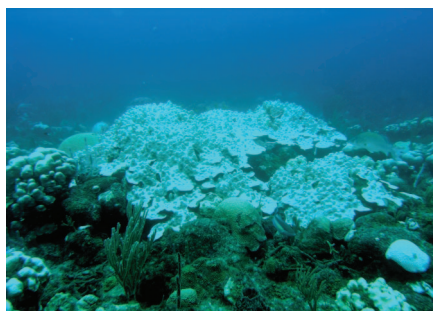
Fig. 1. Underwater photograph of coral reef taken on October 5, 2005 at Savana Island off of St. Thomas, U.S. Virgin Islands. Bleached coral is a large colony of Montastraea faveolata , one of the major framework species in the Caribbean.

Donner et al. (9) use the extensive SST database of the Advanced Very-High-Resolution Radiometer Pathfinder satellite processed by the National Oceanic and Atmospheric Administration (NOAA) Coral Reef Watch program ( http://coralreefwatch.noaa.gov ). The analysis of the SST data is presented in the form of degree heating weeks