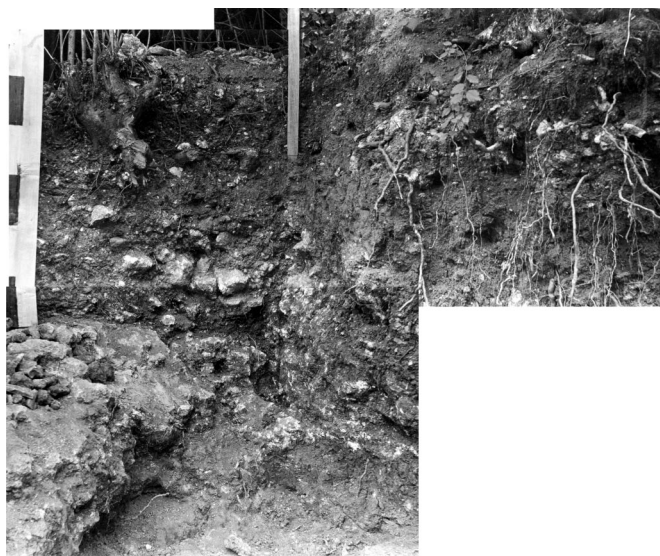
Fig. 1. Photograph of the south and west faces of Delporte's "box" section excavated along the southern edge of the site. Note the contrast between the very loose appearance of the deposits, with many protruding roots, exposed in the western (i.e., right-hand-side) section of the deposits and the much more consolidated appearance of the deposits, with no visible roots, exposed in the adjacent, southern face. These confirm Delporte's observation that the easternmost limits of the 19th century excavations extended for a short distance into the western part of the box section (see Fig. 2). Composite image was compiled by F. d'Errico from photographs in the Museum of National Archaeology, St. Germain-en-Laye (Paris), and is reproduced with permission.

they correctly point out (ref. 10, p. 12644), in "western European cave sites of this time range, most archeological levels are palimpsests of alternating uses of the same place by two kinds of bone-accumulating agents, humans and carnivores." Even if carnivore activity could have caused some localized disturbance within the individual levels in the Châtelperron sequence, the mere presence of carnivores is effectively irrelevant to the overall integrity of the stratigraphic and archaeological sequence in the site as a whole. The relevance of this observation for the interpretation of the radiocarbon dates for the site is discussed further below.