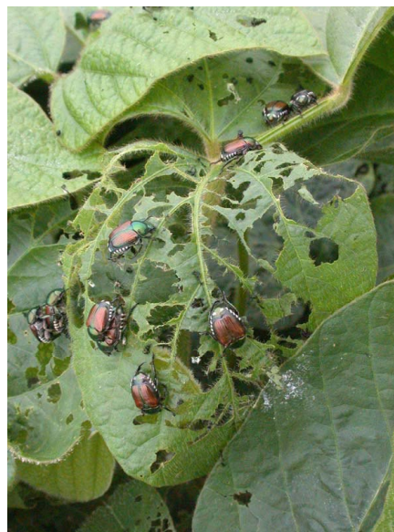
Fig. 2. Japanese beetles ( Popillia japonica ) consuming soybean leaves. The Japanese beetle is a broadly polyphagous species introduced into the United States in 1916 that is now expanding its range throughout the Midwest (27). Japanese beetles are attracted to poorly defended, high-sugar soybean leaves that develop under elevated CO 2 . Future increases in CO 2 and temperature may further the success of such destructive invasive species (28)

A rise in CO 2 generally increases the carbon-to-nitrogen ratio of plant tissues (17, 18), reducing the nutritional quality for protein-limited insects (19). Insects may accelerate their food intake to compensate for reduced leaf nitrogen content (19–21), although this is not always the case (22, 23). By exposing a soybean crop to elevated CO 2 under