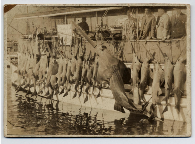
Fig. 3. A sporting day's catch of sawfish in the Florida Keys in the 1940s.