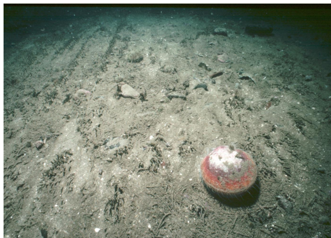
Fig. 1. Impact of trawling on the seafloor at \approx 18 m depth in the Swan Island Conservation Area, northern Gulf of Maine (42). The straight lines are furrows made by the trawl, and the debris is polychaete worm tubes.

The occurrence of trophic cascades is closely linked to the phenomenon of fishing down the food web (1). Analysis of Food and Agriculture Organization global fisheries data showed a decline in mean trophic level of the global predatory fish catch of \approx 0.1 per