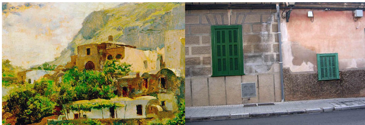
Fig. 1. Two examples of the stimuli used in the experiment. (Left) "Paisaje de Capri" (1878), painting by Francisco Pradilla y Ortiz, printed with permission from the Museo Nacional del Prado (Madrid, Spain) Archivo fotográfico. (Right) Photograph of an urban landscape.

regions. Fig. 3 shows the areas that were more activated in beautiful than in not-beautiful perception, regardless of the participant's gender (that is, the main effects of aesthetic preference).