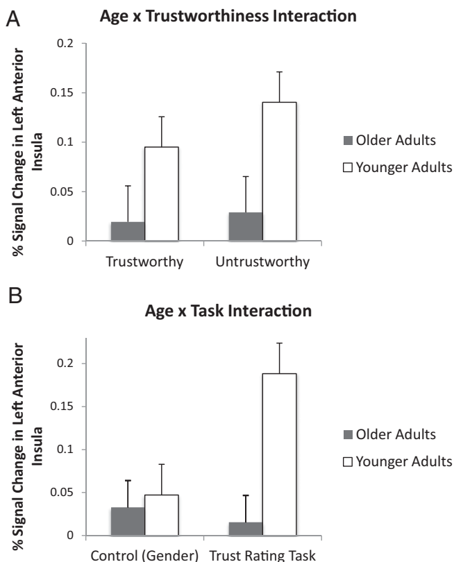
Fig. 2. Activation of left anterior insula in younger and older adults in response to facial cues (A) and task (B).

Although we did not expect to see an age by task interaction in the amygdala [because the threat-related amygdala response is thought to be automatic and thus should be present during both explicit and implicit (gender) perceptions of trustworthiness], our hypothesized age by face type interaction was not found. This lack of significant findings for the amygdala is a surprise, given previous research (4, 11) that implicates the amygdala in perceptions of trust. It may be that the amygdala is not engaged in responses to stimuli such as these. Specifically, the stimuli in this study did not explicitly convey emotional states, which reduces the likelihood of seeing a robust amygdala response. Alternatively, prior work (4, 11) has shown several different patterns of amygdala activation in response to trust cues, and so there is currently little basis for predicting exactly how the amygdala may be related to perceptions of trust and how that might be moderated by age.