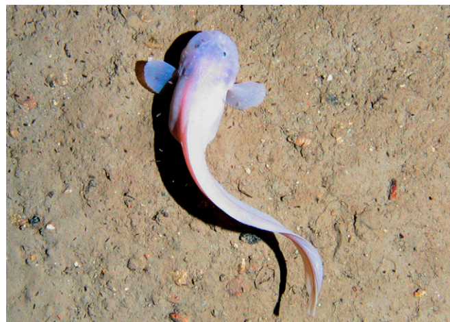
Fig. 1. The hadal snailfish N. kermadecensis (25). The image shows the snailfish alive at 7,199 m, photographed by baited camera close to the site where the samples were retrieved in this study (8). N. kermadecensis is endemic to the Kermadec Trench off New Zealand and occupies a very narrow depth band of 6,472 (24) to 7,561 m (8). The samples recovered for this study represent the second time this fish has ever been captured (the first time in 59 y) and represents the second deepest fish ever seen alive (7).

Tissue Integrity. Dorsal white muscle samples of the hadal snailfish were analyzed in several ways. We first tested for changes that might have occurred during the fish trap's 3 h 11 min ascent by analyzing water, sodium, potassium, and trimethylamine (TMA) contents. The muscles had a mean water content of 84.8 \pm 1.1\% (wt/wt), very similar to those in bathyal and abyssal species from 2,000–3,000 m (26). Sodium and potassium contents were 199 \pm 19 and 48.2 \pm 5.1 mmol/kg, respectively, differing considerably from seawater, which at 35 ppt has sodium and