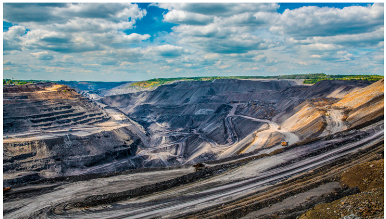
Mining is one example of the human impact on geodiversity. Active mines cause a decrease in local biodiversity, but in some cases they can provide an important habitat for specialized and rare species after the mine has been abandoned.

Although the current essential variables frameworks account for the biosphere, atmosphere, and some aspects of the hydrosphere (1–4), they largely overlook geodiversity—the variety of abiotic features