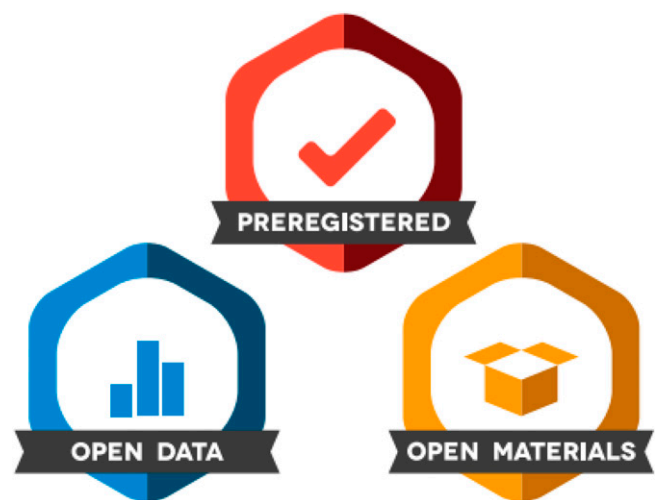
Fig. 2. Examples of badges offered by the Center for Open Science that can be adopted by journals. Badges recognize those studies that meet standards for open data, open materials, and preregistration ( https://cos.io/ ).

A second counterproductive usage is “conflict of interest” to encompass relationships that should be disclosed. This commonplace phrase implies that all such ties necessarily corrupt the research, which is not the case. Use of a more neutral term would encourage vigilance without disincentivizing disclosure. “Competing interest” is used by many journals. “Relevant interest” or “relevant relationship” might be more appropriate.