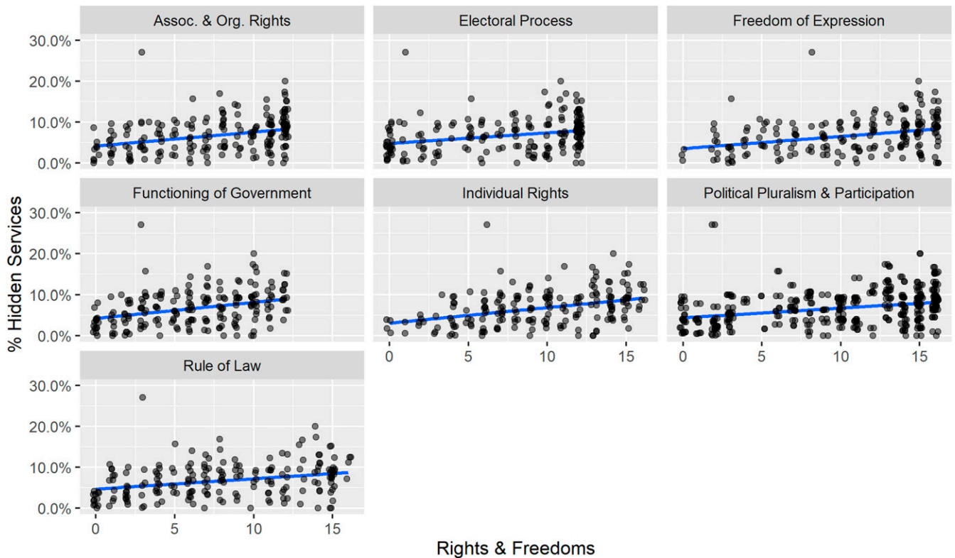
Fig. 3. Data show a positive association between Freedom House’s political freedom subcategories and average daily %HS. Each graph represents a different aspect of political freedom (the freedom of a country’s “electoral process,” its levels of “political pluralism and participation,” the “functioning of government,” the extent of “freedom of expression and belief,” “associational and organizational rights,” “rule of law,” and “personal autonomy/individual rights”). The same 195 countries (each represented by a point) appear in all seven graph. The blue line in each graph is a linear fitted line for the association between each subcategory of political freedom and %HS.

First, while other studies have measured and parsed malicious Tor network traffic (39), our study provides a viable estimates of how users, as distinct from the traffic they generate, employ the