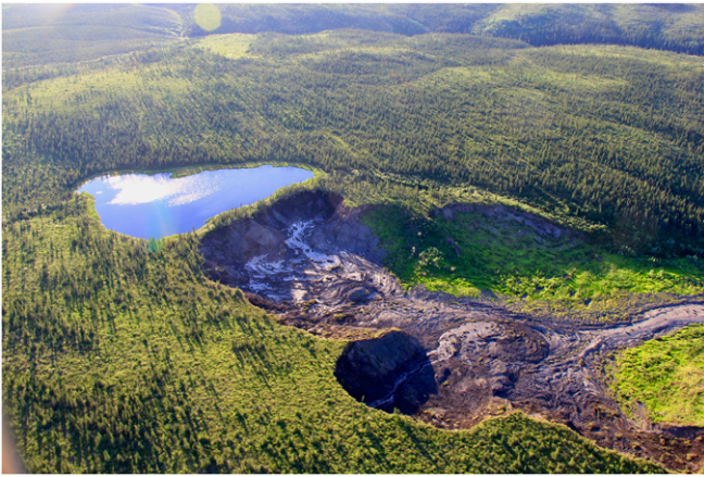
Fig. 1. Abrupt permafrost thaw on the Peel Plateau in Canada. Thawing of ice-rich permafrost can cause abrupt ground collapse, which can further accelerate thaw and amplify permafrost carbon emissions. For scale, the lake length parallel to the headwall of the thaw feature is 150 m.

permafrost and intensifying wildfire regimes present a major challenge to meeting the Paris Agreement’s already difficult goal of holding the global average temperature increase to well below 2 °C above preindustrial levels—and an even bigger challenge to meet the aspirational goal of limiting the temperature increase to 1.5 °C. There is an urgent need for an accelerated scientific effort to more accurately estimate and communicate the likely magnitude of increased carbon dioxide and methane emissions from a warming Arctic to better inform decisions about the “increased ambition” that is needed to keep the global temperature increase well below 2 °C. At present, not even the current scientific understanding of future emissions from a warming Arctic is reflected in most climate policy dialogue and planning. That should be remediated without delay.