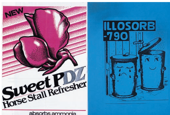
FIG. 9. Footwear and garbage-can zeolite deodorization products [Reproduced with permission from ref. 106 (Copyright 1997, AIMAT)].

Animal-Waste Treatment. Natural zeolites are potentially capable of (i) reducing the malodor and increasing the nitrogen retentivity of animal wastes, (ii) controlling the moisture content for ease of handling of excrement, and (iii) purifying the methane gas produced by the anaerobic digestion of manure. Several hundred tonnes of clinoptilolite is used each year in Japanese chicken houses; it is either mixed with the droppings or packed in boxes suspended from the ceilings (K. Torii, unpublished work). A zeolite-filled air scrubber was used to improve poultry-house environments by extracting NH_3 from the air without the loss of heat that accompanies ventilation in colder weather (93). Granular clinoptilolite added to a cattle feedlot ( 2.44 \text{ kg/m}^2 ) significantly reduced NH_3 evolution and odor compared with untreated areas (94). As more and more animals and poultry are raised close to the markets to reduce transportation costs, the need to decrease