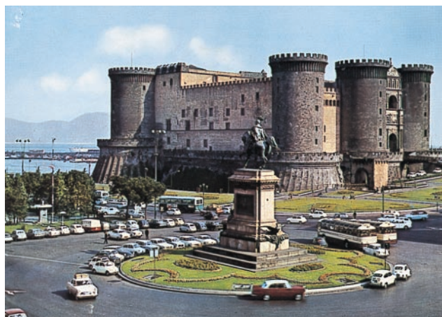
FIG. 2. Castel Nuovo (Naples, Italy) constructed of tuffo giallo napoletano.

materials have been used in cement production throughout Europe. The high silica content of the zeolites neutralizes excess lime produced by setting concrete, much like finely powdered pumice or fly ash. In the U.S., nearly $1 million was saved in 1912 during the construction of the 240-mile-long Los Angeles aqueduct by replacing \leq 25\% of the required portland cement with an inexpensive clinoptilolite-rich tuff mined near Tehachapi, CA (8, 9).