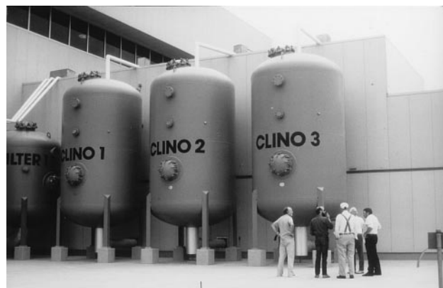
FIG. 4. Clinoptilolite-filled columns at a Denver, CO, water-purification plant [Reproduced with permission from ref. 106 (Copyright 1997, AIMAT)].

clinoptilolite for extracting \text{NH}_4^+ from municipal and agricultural waste streams. The clinoptilolite exchange process at the Tahoe-Truckee (Truckee, CA) sewage treatment plant removes >97\% of the \text{NH}_4^+ from tertiary effluent (15). Hundreds of papers have dealt with wastewater treatment by natural zeolites. Adding powdered clinoptilolite to sewage before aeration increased \text{O}_2 -consumption and sedimentation, resulting in a sludge that can be more easily dewatered and, hence, used as a fertilizer (16). Nitrification of sludge is accelerated by the use of clinoptilolite, which selectively exchanges \text{NH}_4^+ from wastewater and provides an ideal growth medium for nitrifying bacteria, which then oxidize \text{NH}_4^+ to nitrate (17–19). Liberti et al. (19) described a nutrient-removal process called RIM-NUT that uses the selective exchange by clinoptilolite and an organic resin to remove \text{N}_2 and P from sewage effluent.