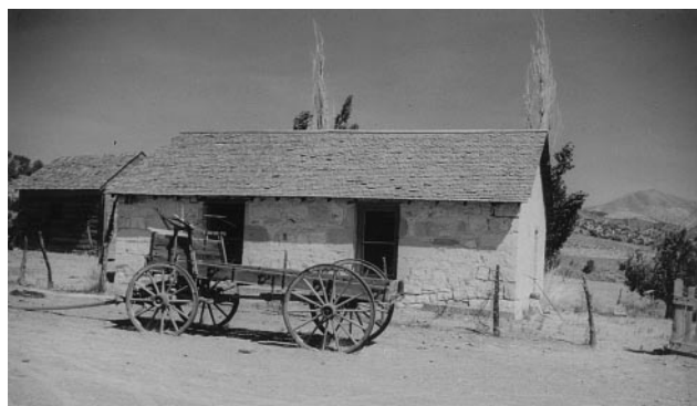
FIG. 3. Abandoned ranch house in Jersey Valley, NV, constructed of quarried blocks of erionite-rich tuff [Reproduced with permission from ref. 5 (Copyright 1973, Industrial Minerals)].

Municipal Wastewater. Large-scale cation-exchange processes using natural zeolites were first developed by Ames (1) and Mercer et al. (2), who demonstrated the effectiveness of