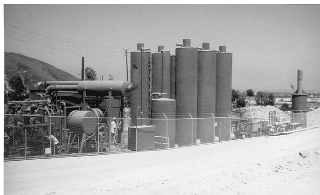
FIG. 5. Methane-purification pressure-swing adsorption unit, NRG Company, Palos Verde Landfill, Los Angeles, CA [Reproduced with permission from ref. 106 (Copyright 1997, AIMAT)].

Drinking Water. In the late 1970s, a 1-MGD (million gallons per day) water-reuse process that used clinoptilolite cation-exchange columns went on stream in Denver, CO, (Fig. 4) and brought the \text{NH}_4^+ content of sewage effluent down to potable standards ( <1 ppm; refs. 20–22). Based on Sims and coworkers' (23, 24) earlier finding that nitrification of sewage sludge was enhanced by the presence of clinoptilolite, a clinoptilolite-amended slow-sand filtration process for drinking water for the city of Logan, UT, was evaluated. By adding a layer of crushed zeolite, the filtration rate tripled, with no deleterious effects. At Buki Island, upstream from Budapest, clinoptilolite filtration reduced the \text{NH}_3 content of drinking water from 15–22 ppm to <2 ppm (25, 26). Clinoptilolite beds are used regularly to upgrade river water to potable standards at Ryazan and other localities in Russia and at Uzhgorod, Ukraine (27, 28).