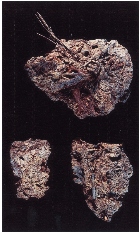
Fig. 1. Human paleofeces from Hinds Cave, Texas. [Scale, 1 cm in the photo is equal to 2.78 cm real (slide).]

PCR, the consensus sequences of each group of related sequences were taken to represent the sequence of a particular plant present in the paleofecal specimen. These sequences were taxonomically identified as described (1) by using the program BLASTN (January 20, 2000). Families and orders matching a 0 and/or 1 mismatch were noted. Where only one family matched the sequence, that family was assumed to be correct, where two or more families from the same order matched, the order was deemed the correct order. Five clones that could not be associated with any sequence cluster and matched database entries at more than two differences were deemed nonidentifiable. Finally, two identical clones from sample II (see Fig. 3, indicated by *) carried one difference to two families from the order Zingiberales. Members of this order are neither arid-adapted, nor adapted to continental climates, hence, the simplest explanation for this finding is a misidentification, probably because no representative of the correct family is present in the database.