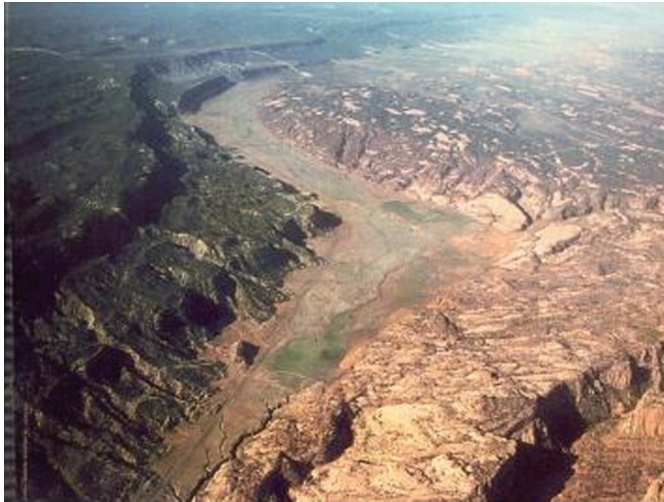
Fig. 1. Long House Valley, looking to the South.

the rise and fall of alluvial groundwater and the deposition and erosion of flood plain sediments. Based on statistical relationships between PDSI and annual crop yields in southwestern Colorado provided by Van West (14), these measures of environmental variability are used to create a dynamic landscape of annual potential maize production, in kilograms, for each hectare in the study area for the period A.D. 400-1400. Intensive archaeological research provides a database on human settlement in the valley (8, 15). l Finally, detailed regional ethnographies provide an empirical basis for generating plausible behavioral rules for the agents (17–19).