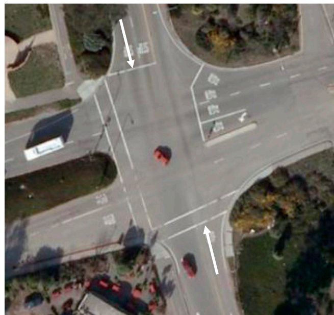
Fig. 3. Aerial view of four-way intersection (from study 1). White arrows depict highways used by coders to code driver behavior at the intersection.

Procedure. Coding took place from ~2:00 PM to 5:00 PM on three weekdays in June 2011, at an unprotected but marked crosswalk of a busy one-way road. A coder (blind to the hypotheses of the study) positioned him- or herself near the crosswalk, beyond drivers' direct line of sight, and recorded whether an approaching vehicle yielded for a pedestrian—a confederate of the study—who was waiting to cross (a photo series depicting the procedure is presented in Fig. 4). Sex of the confederate was alternated. Paralleling study 1, the coder rated the perceived status of an approaching vehicle using its make, age, and physical appearance (1 = low status, 5 = high status; M = 3.22 , SD = 0.96 ). A breakdown of the vehicles in the current study by vehicle status is presented in Table S1. Coders also noted the vehicle driver's sex