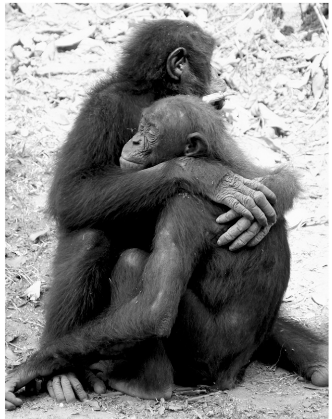
Fig. 1. One juvenile bonobo embraces a distressed companion during postconflict consolation. at the Lola ya Bonobo Sanctuary in the Democratic Republic of the Congo.

Juvenile bonobos with signs of better social and emotional competence were more likely to respond to the distress of others by offering consolation. There was a direct positive correlation between how juveniles handled their own distress events as victims and how they responded to distress witnessed in others: individuals quicker to recover from their own distress as victims were more likely to provide bodily comfort to others. Individuals with higher sociality (expressed in the CSI, a marker of overall social competence) were most likely to offer consolation and approach victims rather than fleeing (expressed in the PRI). In agreement with human infant studies (45, 47), sociality was the best predictor of consolation behavior. Consistent with empathy-