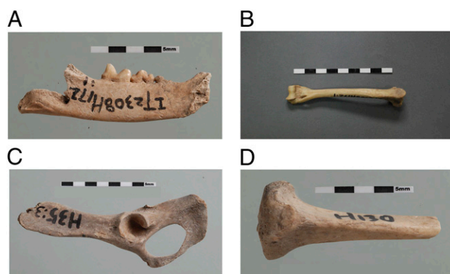
Fig. 1. Felid specimens from the site of Quanhucun showing key body parts and the presence of an aged animal with worn dentition. (A) Left mandible with worn fourth premolar and first molar; (B) right humerus; (C) left pelvis; (D) proximal left tibia.

and 5560–5470 cal B.P., respectively, if one SD is adopted. In brief, these cats date to ca. 5,300 y ago and over a 200-y period.