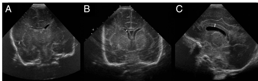
Fig. 1. Shown are measurements (white lines) of the (A) thickness of the AC in the coronal plane, (B) width of the FH of the lateral ventricle in the coronal plane, and (C) width of the body of the CC in the midsagittal plane.

As shown in Table 1, the maternal sounds and control groups did not significantly differ in the following characteristics: sex, birth gestational age, birth weight, 1-min Apgar, 5-min Apgar, head circumference and postmenstrual age at 1-mo cranial ultrasound, days on mechanical ventilation, and administration of antenatal corticosteroids.