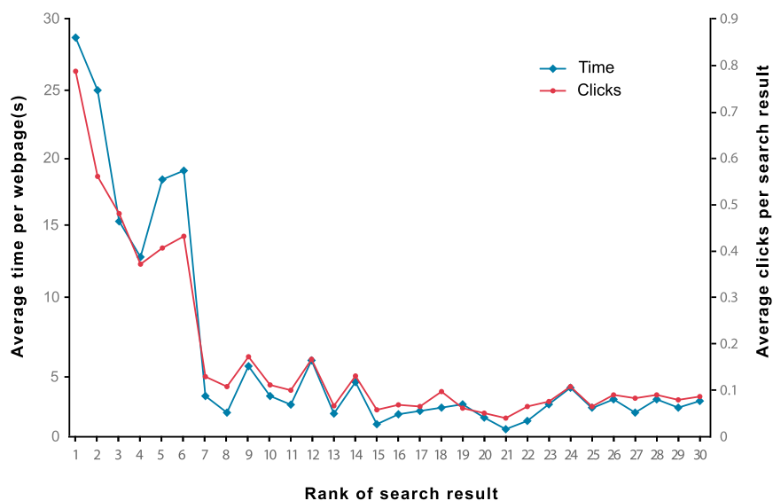
Fig. 2. Clicks on search results and time allocated to Web pages as a function of search result rank, aggregated across the three experiments in study 1. Subjects spent less time on Web pages corresponding to lower-ranked search results (blue curve) and were less likely to click on lower-ranked results (red curve). This pattern is found routinely in studies of Internet search engine use (1–12).

margins: 6.4% within any category of the age or sex measures; 14.1% within any category of the race measure; 18.7% within any category of the income or education measures; and 21.1% within any category of the employment status measure (Table S1). Subjects' political inclinations were fairly balanced, with 20.3% identifying themselves as conservative, 28.8% as moderate, 22.5% as liberal, and 28.4% as indifferent. Political party affiliation, however, was less balanced, with 21.6% identifying as Republican, 19.6% as Independent, 44.8% as Democrat, 6.2% as Libertarian, and 7.8% as other. In aggregate, subjects reported conducting an average of 7.9 searches (SD = 17.5) per day using search engines, and 52.3% reported having conducted searches to learn about political candidates. They also reported having little or no familiarity with the candidates (mean familiarity on a scale of 1–10, 1.4; SD = 0.99). On average, subjects in the first three experiments spent 635.9 s (SD = 307.0) using our mock search engine.