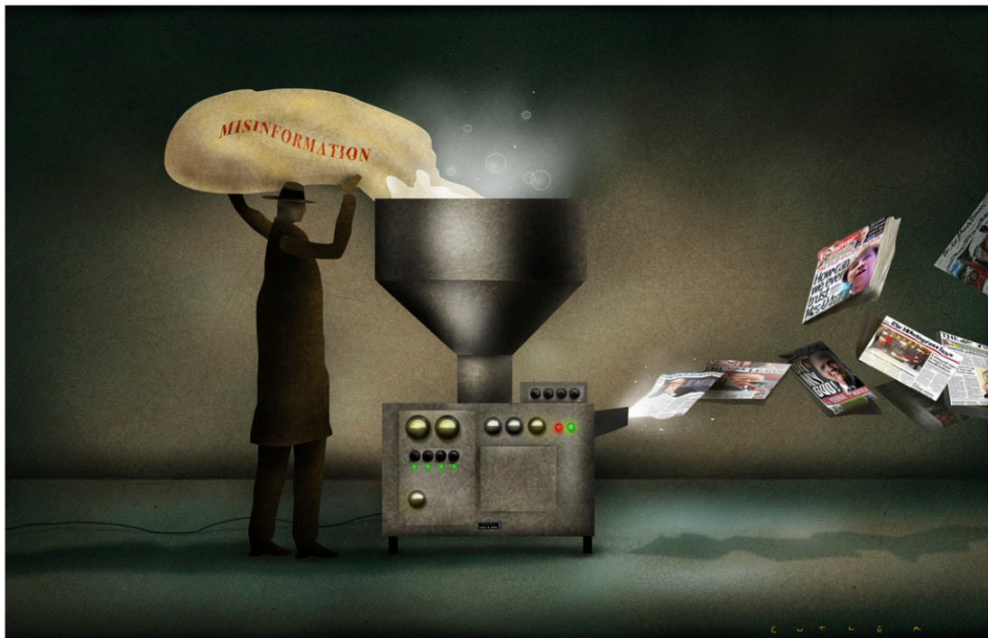
Fig. 1. Fabricated social media posts have lured millions of users into sharing provocative lies. Image courtesy of Dave Cutler (artist).

Social media users were also being targeted by Russian dysinformatyeva : phony stories and advertisements