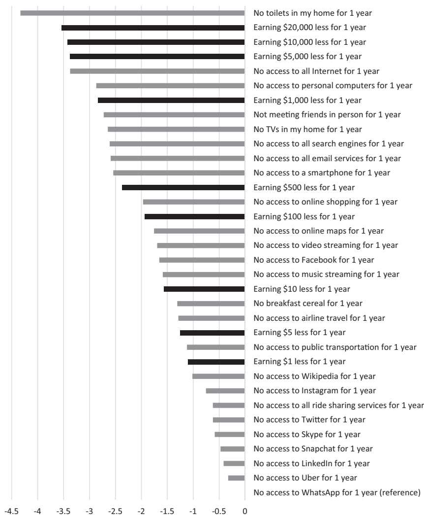
Fig. 2. (Dis)Utility according to BWS.

Our approach evaluates goods for a specific time period from the consumer’s perspective. This is not necessarily the same as the goods’ social value or their values for different time periods. For instance, some goods might have negative externalities that hurt other people’s well-being [e.g., fake-news sharing via social