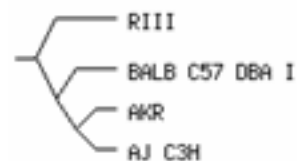
Tree 1 Blocks 1,2,3