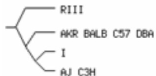
Tree 4 Blocks 6,7,8,9