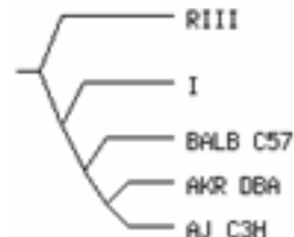
Tree 3 Block 5