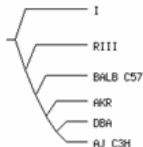
Tree 5 Blocks 10,11,12,13