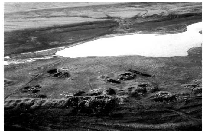
Fig. 3. Aerial view of PaJs-13 showing several excavated houses and the southern part of the cored pond. View is looking northwest.