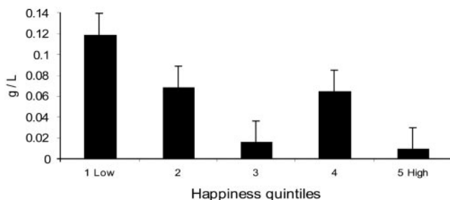
Fig. 2. Happiness and fibrinogen stress responses. Shown is the mean increase in plasma fibrinogen after acute mental stress in the five happiness quintiles, adjusted for gender, age, grade of employment, BMI, smoking, baseline fibrinogen, and GHQ. Error bars are SEM. Differences in fibrinogen stress responses across happiness quintiles were significant ( P = 0.011 ).

a stress-induced increase in fibrinogen were 3.72 (confidence interval 1.16–11.9) for participants in happiness quintile 1, adjusted for covariates including GHQ score, compared with the highest happiness quintile.