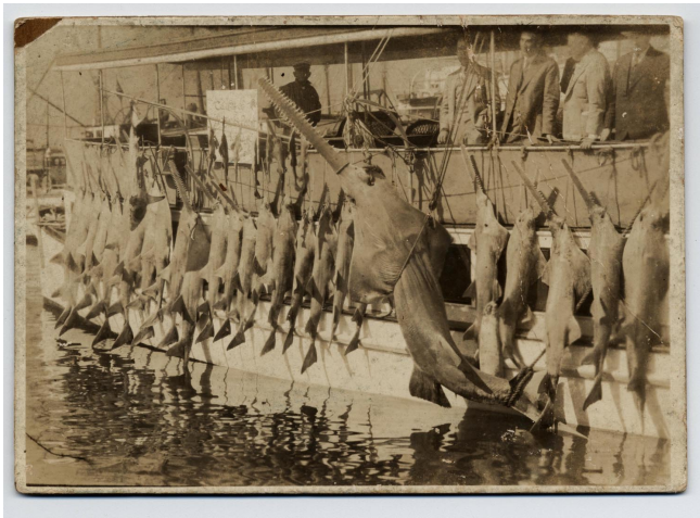
Fig. 3. A sporting day's catch of sawfish in the Florida Keys in the 1940s.