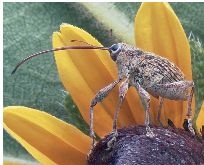
Fig. 1. Curculio proboscideus (Curculionidae: Curculioninae) perched atop a flower of Helianthus sp. (Asteraceae). Note the elongation of the head to form the characteristic weevil rostrum or “snout.” In some groups, the rostrum is not only used for feeding, but also for preparing oviposition sites and placing eggs deep inside plant tissues (Photo credit: D. McKenna).

Weevils first appear unequivocally in the Late Jurassic fossil record (Karatau, Oxfordian-Kimmeridgian, 161.2–150.8 Ma) (5). These early weevils belong to the family Nemonychidae (2) and most likely developed in the reproductive structures of conifers in a manner similar to living nemonychids (6, 7). While early weevils most likely fed on conifers, most living weevil species are specialist herbivores on flowering plants (angiosperms; >250,000 living species). Shifts to feeding on angiosperms are associated with enhanced taxonomic diversification