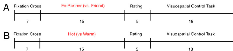
Fig. 1. Time course of Social Rejection and Physical Pain trials. The Social Rejection and Physical Pain tasks each consisted of two consecutively administered runs of eight trials (i.e., 16 total trials). The order of the two tasks was counterbalanced across participants. (A) Each Social Rejection trial lasted 45 s and began with a 7-s fixation cross. Subsequently, participants saw a headshot photograph of their ex-partner or a close friend for 15 s. A cue phrase beneath each photo directed participants to think about how they felt during their break-up experience with their ex-partner or a specific positive experience with their friend. Subsequently, participants rated how they felt using a five-point scale (1 = very bad; 5 = very good). To reduce carryover effects between trials, participants then performed an 18-s visuospatial control task in which they saw an arrow pointing left or right and were asked to indicate which direction the arrow was pointing. Ex-partner vs. Friend trials were randomly presented with the constraint that no trial repeated consecutively more than twice. (B) The structure of Physical Pain trials was identical to Social Rejection trials with the following exceptions. During the 15-s thermal stimulation period, participants viewed a fixation cross and focused on the sensations they experienced as a hot (painful) or warm (nonpainful) stimulus was applied (1.5-s temperature ramp up/down, 12 s at peak temperature) to their left volar forearm (for details, see Methods ). They then rated the pain they experienced using a five-point scale (1 = very painful; 5 = not painful).